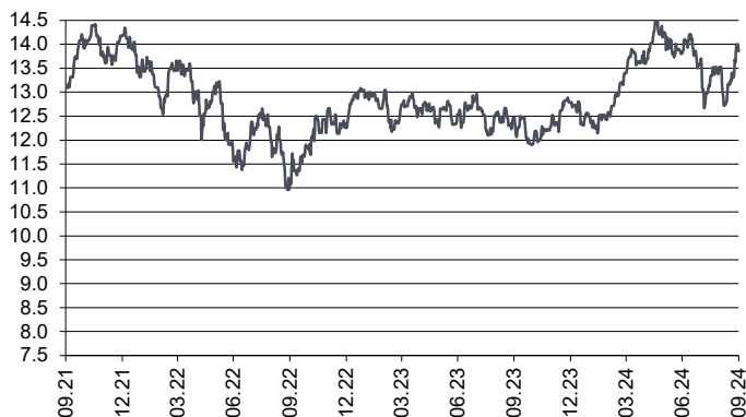
Share price movement (last 36 months)

Fund has invested into Chinese equities through iShares MSCI China ETF and Alibaba equity positions. Alibaba's stock trades at 11 times earnings. The company's net cash position accounts for about 25% of Alibaba's market value, and the company is conducting share buybacks amounting to about 9% of its market value. In general, Chinese equities are cheap and we there is upside if the policy stance is significantly changing.